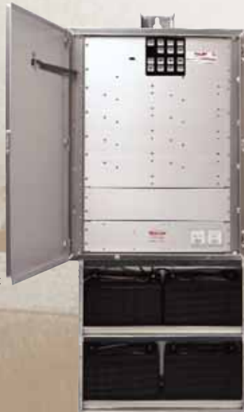
Type III Electronic Cabinet