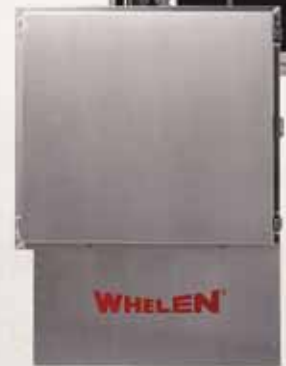
TYPE II ELECTRONIC CABINET

Ten models serve a wide variety of applications as shown here in ratio to a person's size.