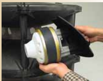
Whelen WPS2910 installed on site in Columbus, Georgia.