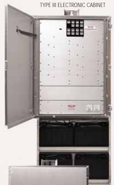
TYPE III ELECTRONIC CABINET